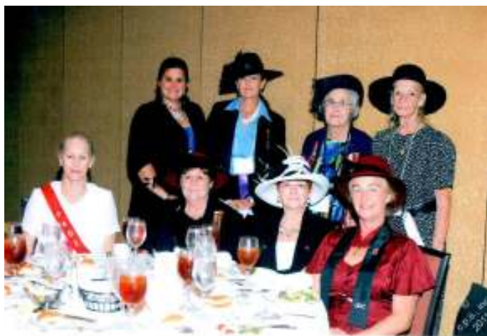
Saturday Morning District Luncheon