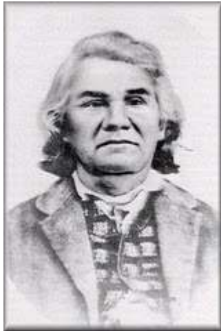
Principal Chief of the Cherokee Nation

Brig. Gen. Stand Watie authorized to raise his own brigade. He was the only Indian to serve as a general on either side.