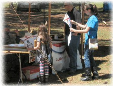
Children were interested in the SCV posters and happy to learn they could take one home.