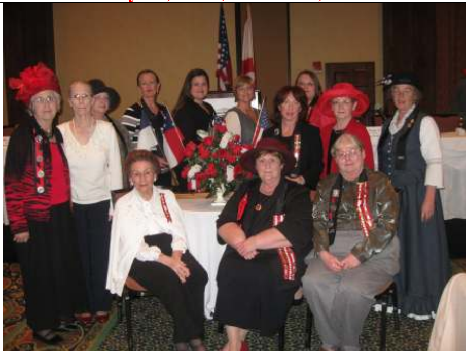
Members of Gen. Edmond Winchester Rucker Chapter attended the 2012 Alabama Division UDC Winter Board meeting in Prattville on January 21