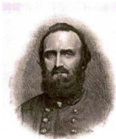
Lt. General Thomas J. Jackson

Captain, my religious belief teaches me to feel as safe in battle as in bed. God has fixed the time for my death. I do not concern myself about that, but to be always ready, no matter when it may overtake me. That is the way all men should live, and then all would be equally brave. -- Gen. Thomas J. “Stonewall” Jackson