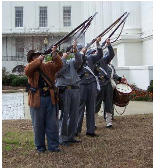
For Ol' Marse Robert