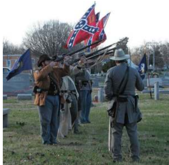
An Honor Guard fired the volleys.