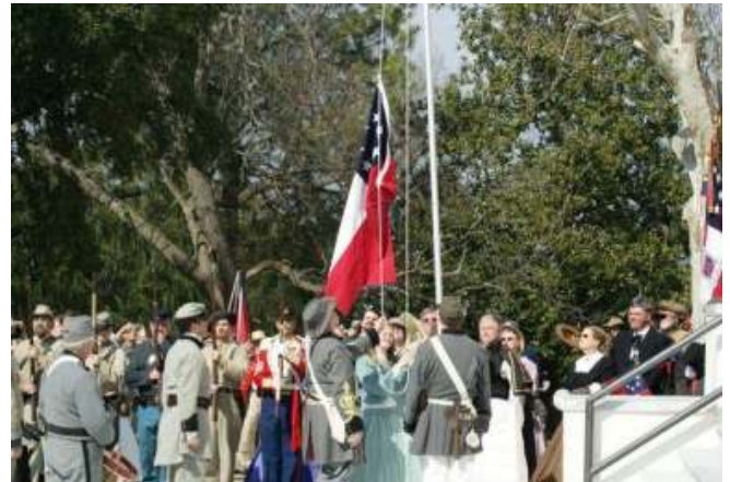
Raising of the First National Flag at the Capitol