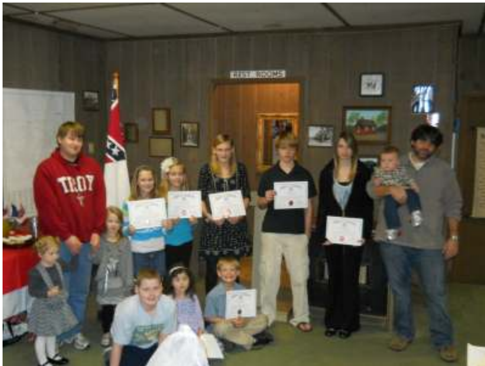
Members of Rucker's Belles and Beaux Chapter, Children of the Confederacy