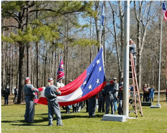
Raising the Confederate Flag

The crowd enjoyed a day of good food, fellowship, and live music. Clanton's Battery presented "Rolling Thunder," and attendees had an opportunity to fire a cannon or a rifle. The raising of the flag and dedication of the Confederate monument were moving tributes to our ancestors.