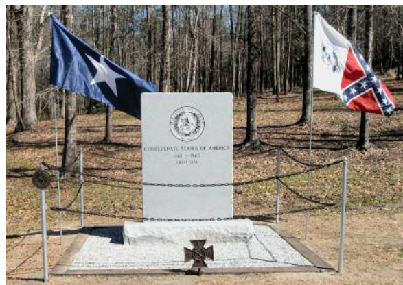
The Monument to the Confederate State of America