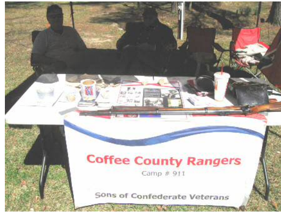
Camp 911 Tent

The crowd enjoyed a day of good food, fellowship, and live music. Clanton's Battery presented "Rolling Thunder," and attendees had an opportunity to fire a cannon or a rifle. The raising of the flag and dedication of the Confederate monument were moving tributes to our ancestors.