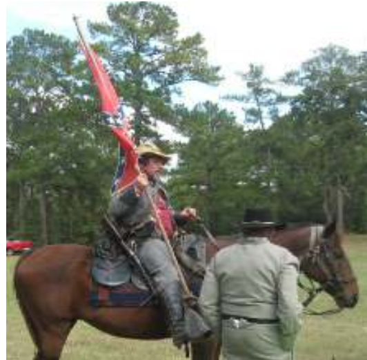
BATTLE OF NEWTON, 2009