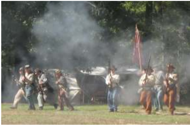
(Below) The battle, as always, was a thrill to watch.