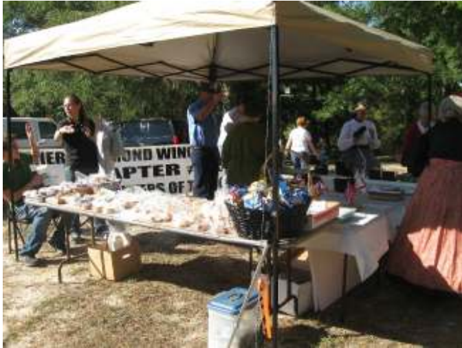
(L) The UDC held a successful bake sale.